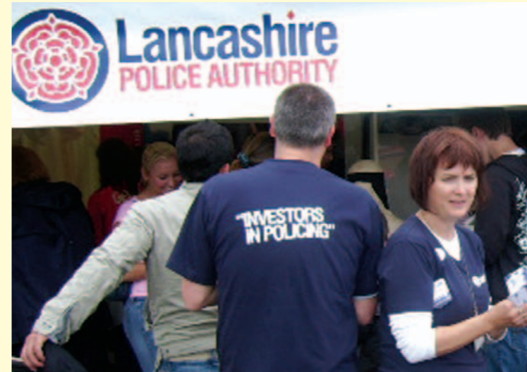
A bustling marquee