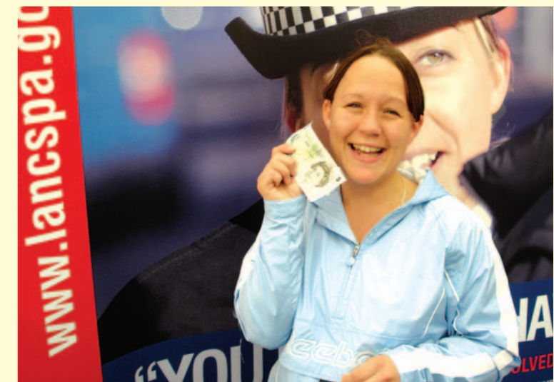
A lucky winner