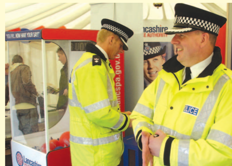
A visit by officers from the Constabulary