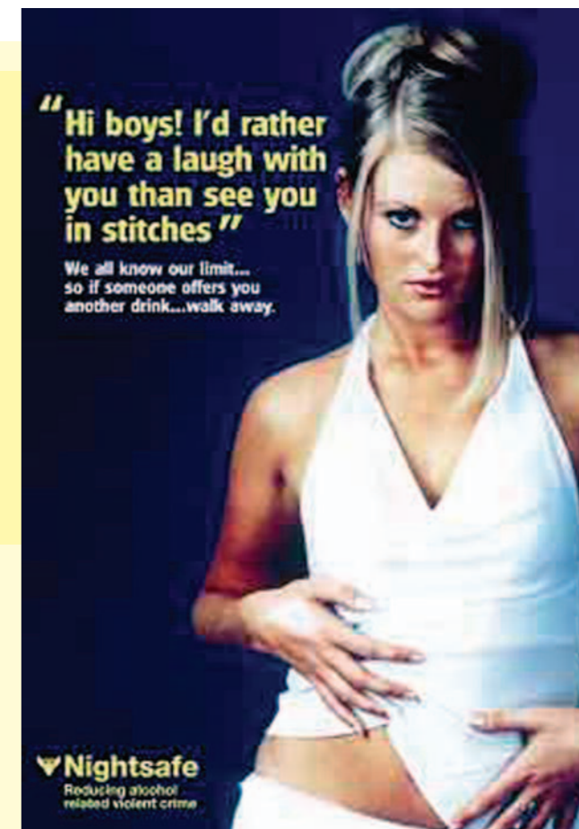
Nightsafe Reducing alcohol related violent crime

"However, there are still the odd few licensed premises that are not signed up and over the next week we are sending out letters to everyone, to remind them about our protocols and that drink discounting is a breach of their operating conditions."