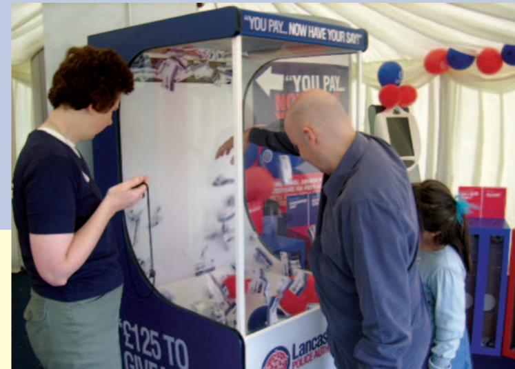
People were invited to 'grab' (and take home) real £5 notes mingled in with 'fake' notes in the wind machine