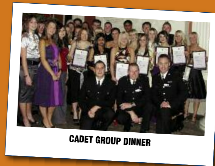
CADET GROUP DINNER